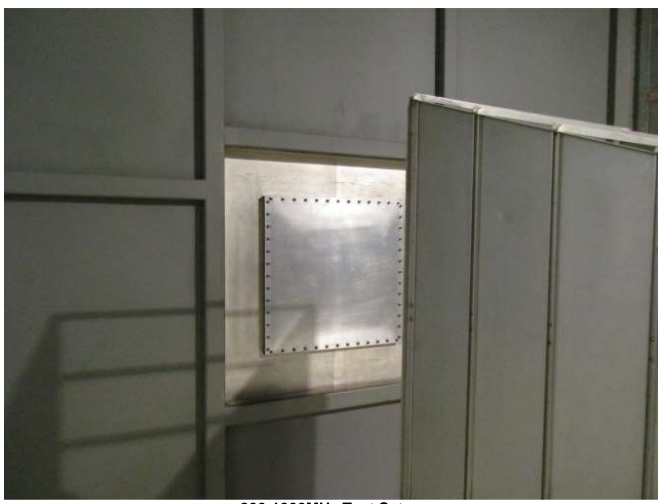
200-1000MHz Test Setup